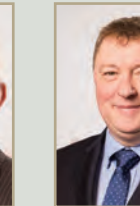
Austen Adams Metalcraft