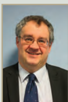
Paul Gilchrist Jacobs UK Ltd